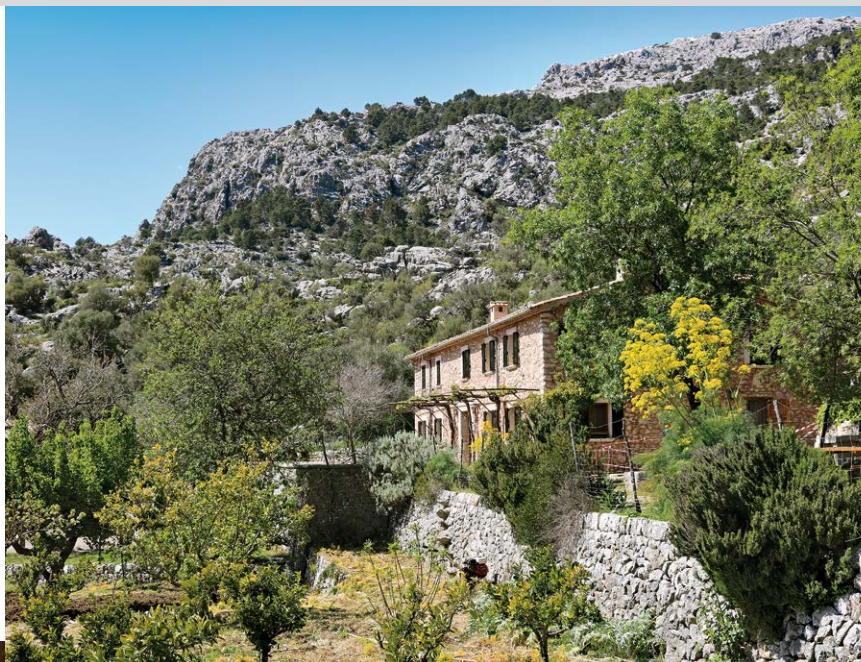
The mountain hut at the foot of the Tossals-Verds massif.

The view of the central plain soon opens up on your right and you can see the Canaleta water channel ahead running across an aquaduct. Cross a ford over the streambed of the Torrent des Prat . Just beforehand a well-trodden path runs up to the water channel (see Walk 37). The path crosses to the other side of the stream again over a wooden footbridge and ascends to a signposted three-way junction. The GR 221 goes right via the Font des Prat to Lluc monastery (see Walk 38). However, keep straight on here in the direction of Font des Noguer and ascend to the Coll des Coloms 6 , 808m. Shortly before the top of the pass hikers with a bit more stamina can undertake a worthwhile detour to Puig des Tossals Verds, 1118m (there and back 2.00 hrs.).