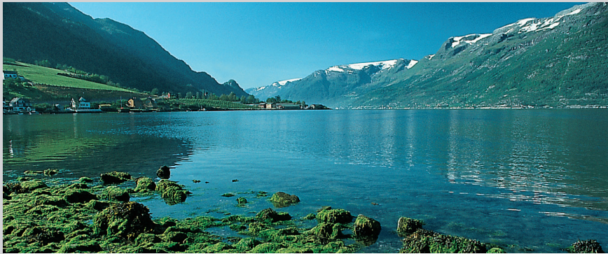
The Sør fjord between Hardangervidda and the glaciated Folgefonn peninsula.