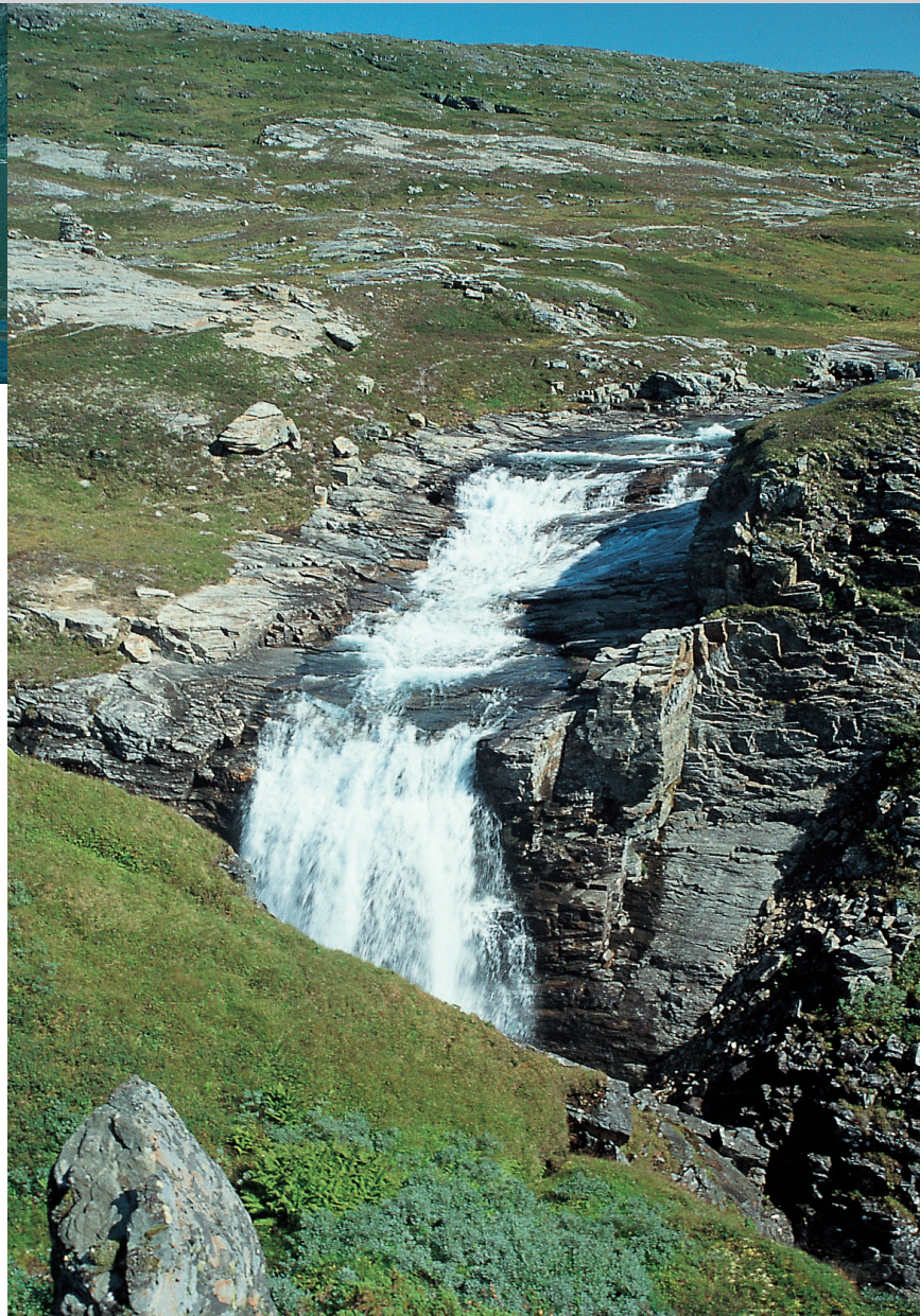
The upper section of Rjukande 'smoking' waterfall.