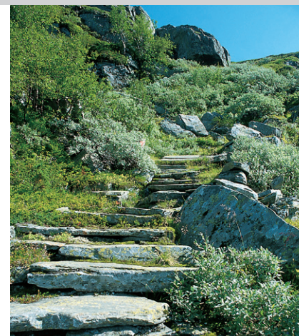
The Munketreppene (monks' steps) are said to have been built by monks in the Middle Ages.

Ullensvang Hotel. The fruit path here leads straight on to Loftus campsite so turn off right and follow the signpost for Nosi along a soon unsurfaced and steep no-through road to the forest. After a barrier the uneven roadway becomes an agricultural track with no traffic. The T-marked path soon leaves the roadway to the right, then winds its way up the hillside and at the upper end of the mountain meadows with lovely views the waymarkers guide you through the forest to Hovden clearing (3) where there's a viewpoint of the same name. At the end of the clearing go up left back to the agricultural path and along this for a short way to the right until the two