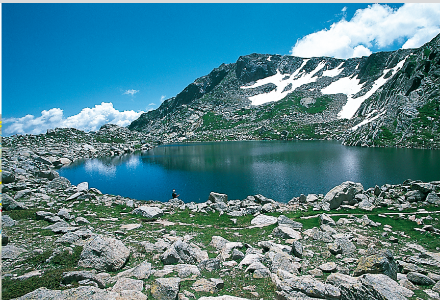
Bastani lake with Monte Renoso.

Start off from the car park at the end of the road by the Gîte U Renosu to continue along the broad gravel road and cross over the wooden bridge. 200m after that, turn diagonally right onto a narrower trail that leads somewhat above a mountain station for a ski-lift. When the trail ends, a cairn-marked path continues to the right, following the ascending ridgeline to reach, after a total of 45 minutes, a small meadowland plateau (1893m) where the Pizzolo stream flows along its course. Pass a basin, criss-crossed by rivulets, on its left side (a pretty spot for a picnic), cross over the stream and climb easily to the left along an almost imperceptible ridge. Soon the ridge appears which will lead to the summit. Cross over another high valley bearing left (if you continue straight on through the valley you can ascend directly up to the Renoso ridge) and after 1½ hrs. reach the shores of Bastani lake , 2089m, nestling in a hollow.