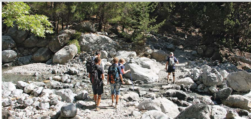
In the rocky upper reaches of the gorge.