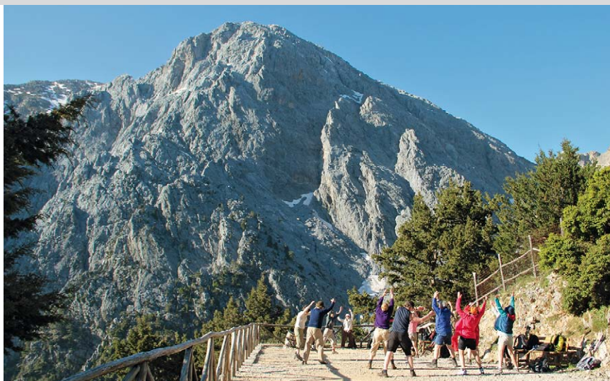
Early morning callisthenics at the gorge entrance with Gingilos in the background.

to problems relating to heatstroke. Be sure to take enough sunscreen! At the half-way point, in the former village of Samaria, there is a first aid station. Camping and also bathing in the gorge are strictly prohibited, but nevertheless, bring along your bathing gear to enjoy the beautiful pebble beach in Agia Roumeli.