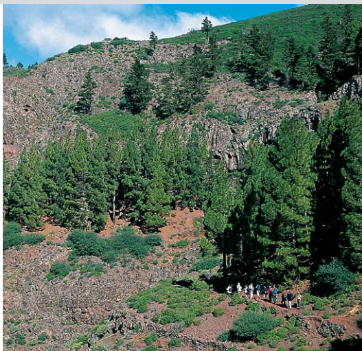
Since the forest fire of 2012, the high trail to Igualero has lost much of its charm.

slope and opening a fantastic view of the Fortaleza. Near a first high tension power pylon also catch a downwards view of the hamlet of Erque nestled in the chasm-like barranco of the same name. In easy up-and-down walking with a lovely view of La Dama and the neighbouring islands of El Hierro and La Palma, traverse the slope. Only after passing the third power pylon (a good ½ hr) does the trail become somewhat steeper. 5 minutes later the trail forks – here turn left (straight on, the GR 132.1 to Erquito branches off). Our camino now climbs through overgrown terraces to the village street of Igualero (4) ; 10 minutes), ascending to the main road (10 minutes; bus stop shelter for lines 1, 6).