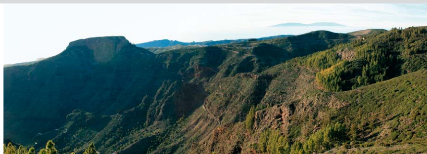
View from Mirador de Igualero of the high mountain trail and to Fortaleza; La Palma in the background.

turns diagonally to the left, parallel to the road, and leads to the hamlet of Apartadero then merges with the road again. Past the Los Camioneros bar and after a sharp right-hand bend (or via the camino through the barranco) reach the hamlet of Pavón (2) . 20m to the right of the transformer tower at the side of the road, a cobblestone street ascends to the left and ends just before a small gentle valley notch. Here right through the notch climbing to the Fortaleza saddle , 1125m, to reach a fork in the trail (to the right a possible excursion onto the Fortaleza, →Walk 22).