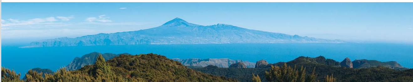
From Garajonay, you can enjoy a splendid view of Tenerife when weather is clear.

the forest fire of 2012. After 10 mins, meet a forestry road – follow this to the left via the GR 131. After a few minutes, another forestry road merges from the left into ours then a quarter of an hour later another forestry road coming from Chipude merges sharply from the left (the return route later on). A good 100m later reach another track forking off (the cobbled road forking left leads to the mountain road with the car park, Alto del Contadero; to the right to the Garajonay summit). We follow the cobbled road 20m to the right and then turn left onto a path that forks shortly after – turn right here crossing the ridge to ascend to the overlook platform at Garajonay (5) ; when weather permits enjoy a wonderful 360° panoramic view.