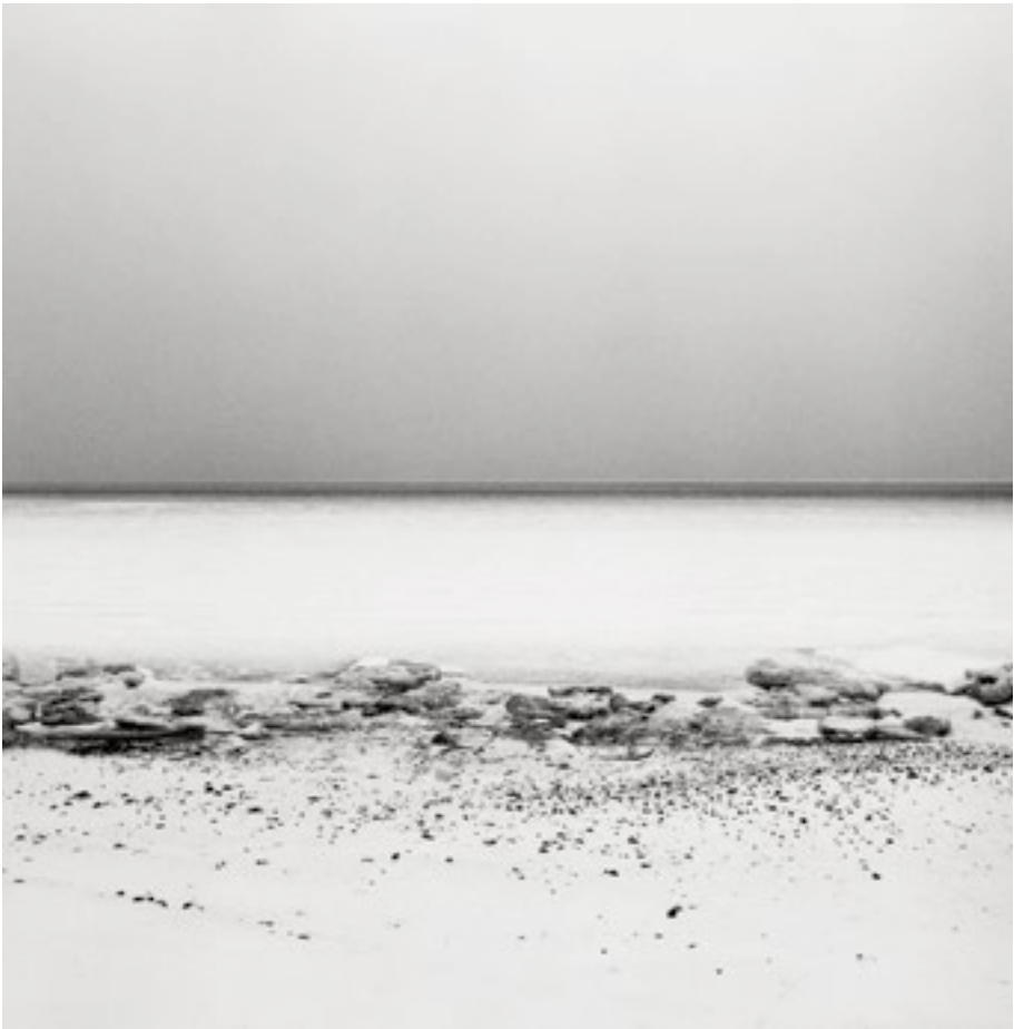
Frozen Sea of Okhotsk, Study 3 Utoro, Hokkaido, 2005