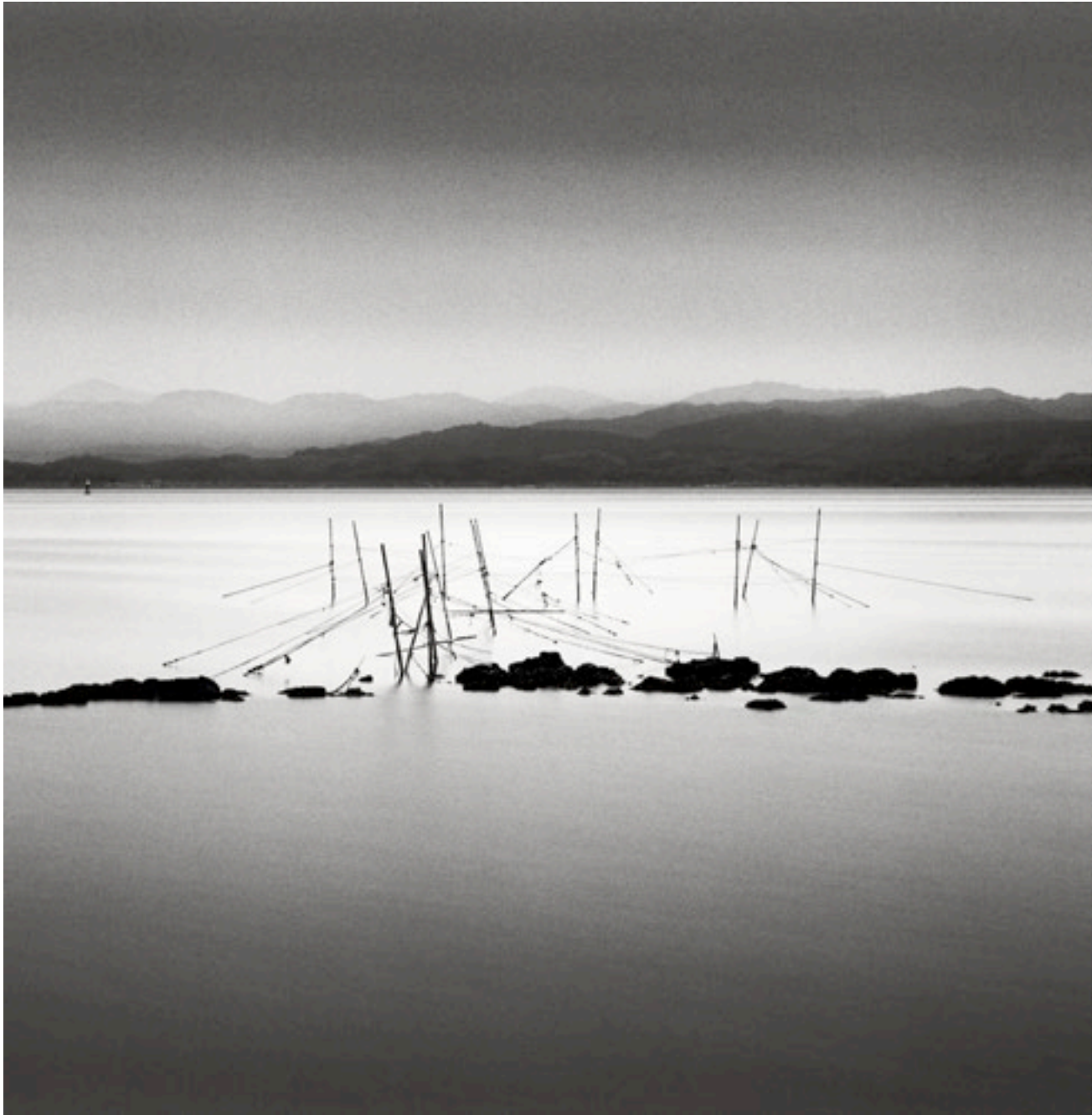
Night Fishing Nets Yatsuka, Honshu, 2001