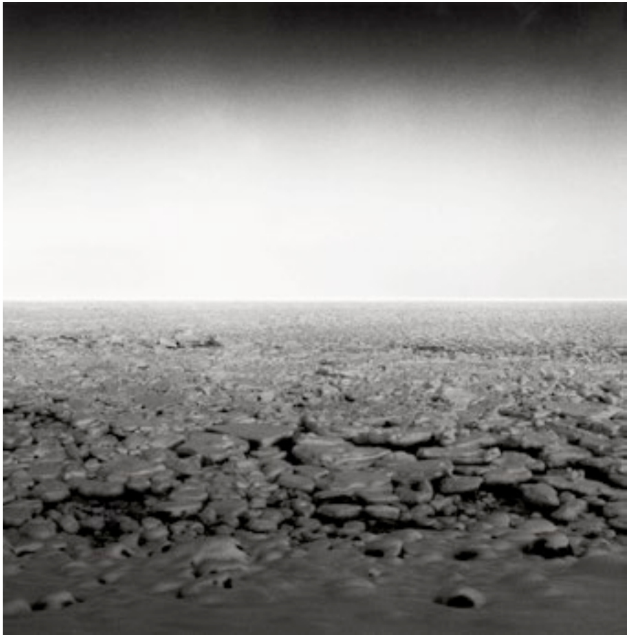
Frozen Sea of Okhotsk, Study 4 Utoro, Hokkaido, 2005