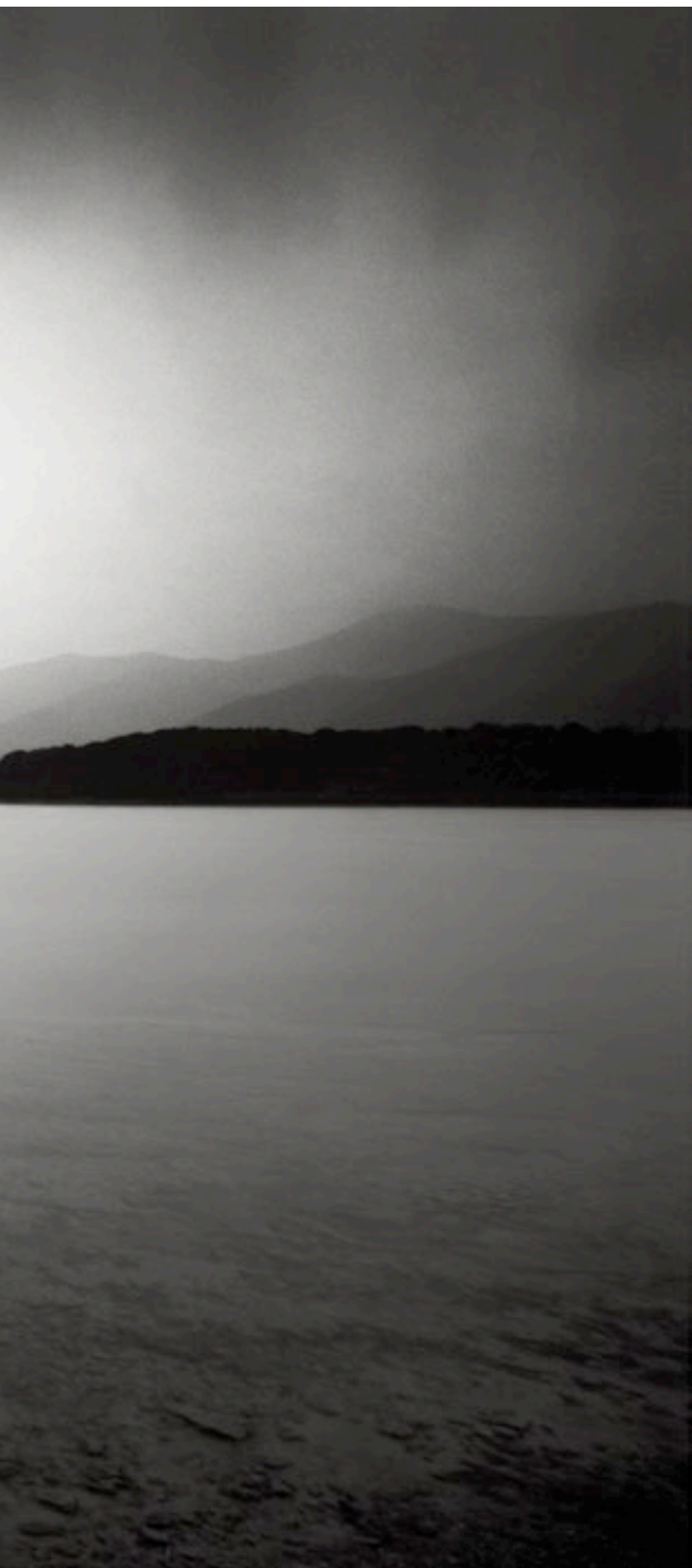
Usori Lake at Dusk Osorezan, Honshu, 2005

The distant mountains Are reflected in the eye Of the dragonfly.