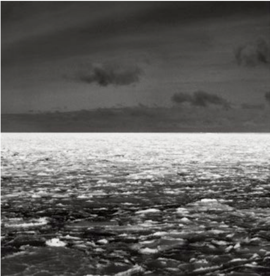
Frozen Sea of Okhotsk, Study 5 Abashiri, Hokkaido, 2007