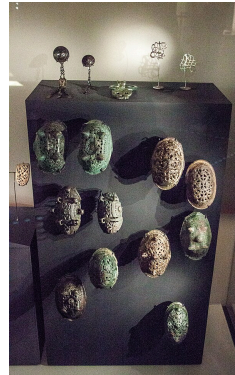
Viking Age [i3]

The magical significance of the runes is particularly evident in their application for healing purposes. During the Viking Age , runes were used in medical spells and healing rituals. Rune inscriptions on amulets were intended to ward off diseases or support healing processes. Rune inscriptions found in Ireland attest to this practice. One inscription states, in essence: "Through writing, the mad woman heals." Such inscriptions illustrate the close connection between