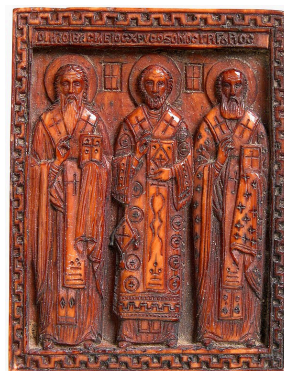
Church Fathers [i3]