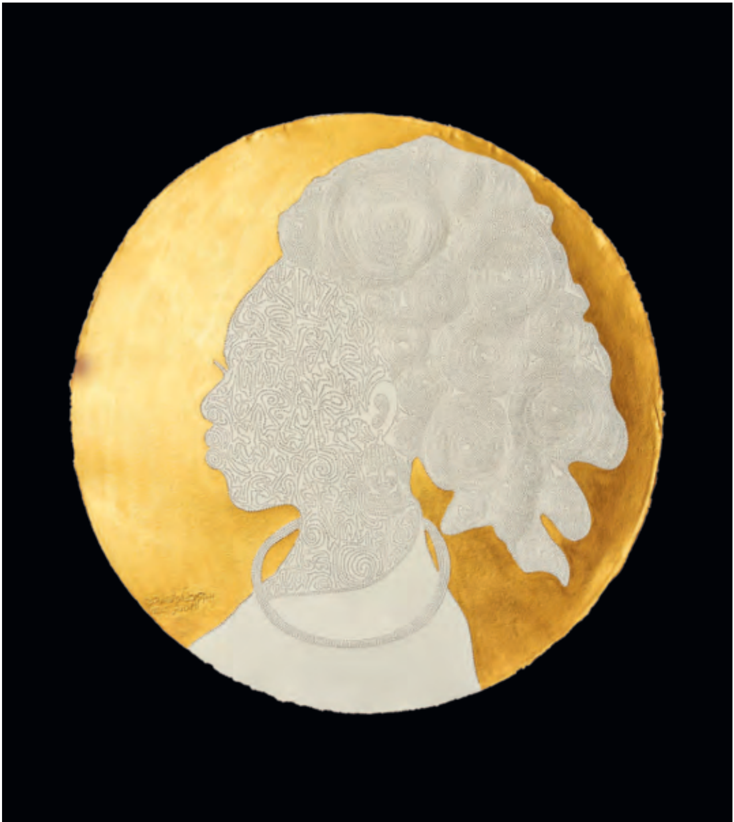
6. Lady Chief , 2020 Perforation with 24k gold leaf on handmade paper, diameter: 44 ½ in. (113 cm)