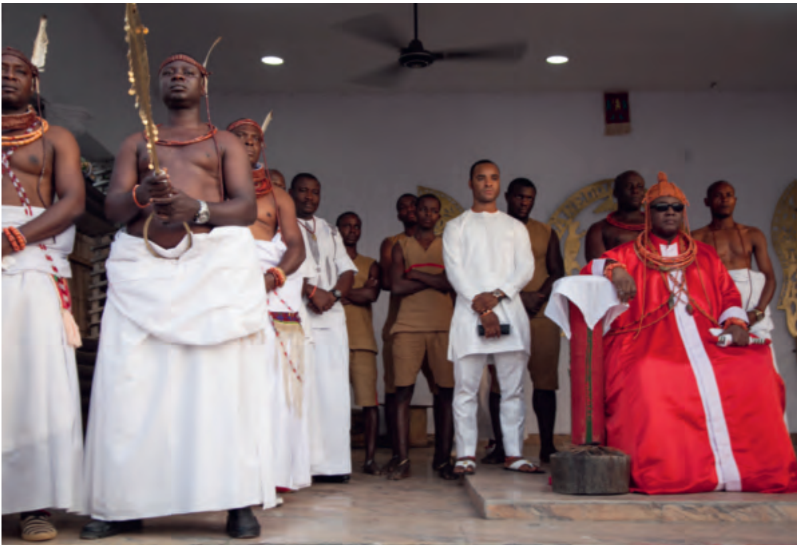
9. Oba Ewuare II at Iguè ceremony, 2019

a divergent lineage of practice made possible by new structures of art production and mediation. His success illustrates how new media modalities trouble established categories of contemporary art practice and reception.