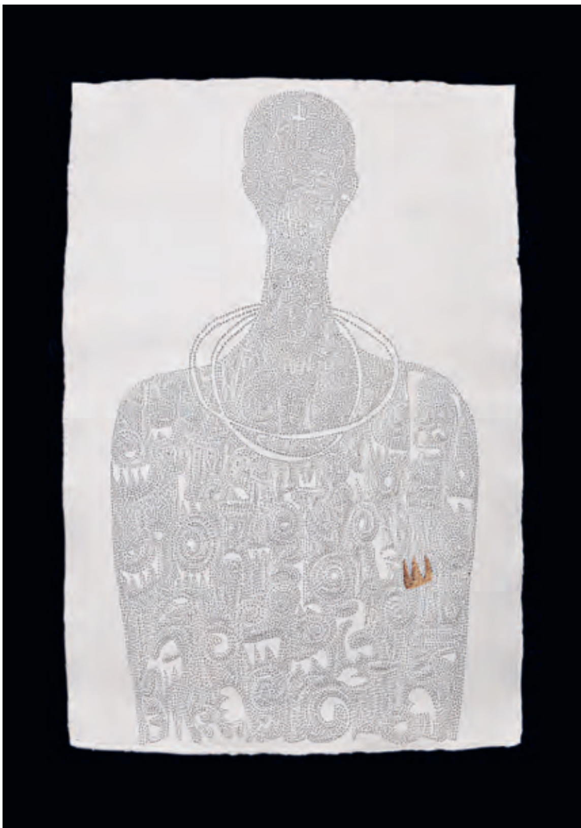
7. The Chief Who Stood His Ground , 2021 Perforation and gold leaf on handmade paper, 28 × 42 in. (71.1 × 106.6 cm)