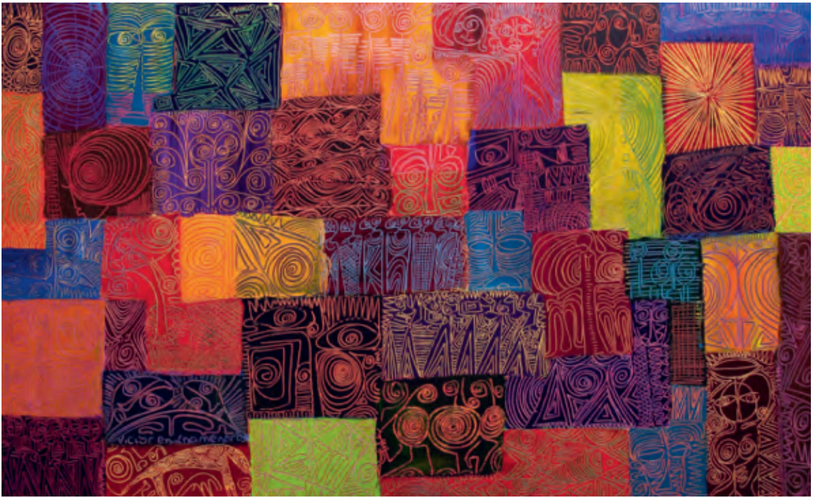
3. Sunday Morning Glory , 2001 Acrylic on paper, 52 × 40 in. (132 × 101.6 cm)

issues of interest to Africans and the global African diaspora. Their formal and conceptual strategies are equally complex. In recent large-scale, mixed-media installations, Ehikhamenor uses Catholic rosaries to construct imposing portraits of Benin kings and queens that speak to the kingdom's history of interaction with Europe but also address contemporary debates about restitution of African cultural patrimony from Western museums. Juxtaposed against canonical sites and images of British colonial power, these rosary artworks explore the bitter clash of the icons and cosmologies of two powerful empires. Ehikhamenor uses their intertwined histories to interrogate the vicissitudes of Black lives in the global context and probe the intersection of