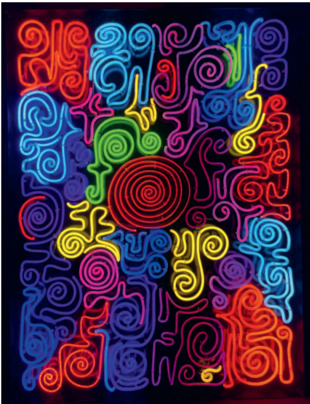
5. Harvesting Dreams And Fireflies With My Brother , 2020 Neon tubing, acrylic, cabinet, and 6ft power cord, 72 × 54 × 10 in. (183 × 137 × 25.4 cm)