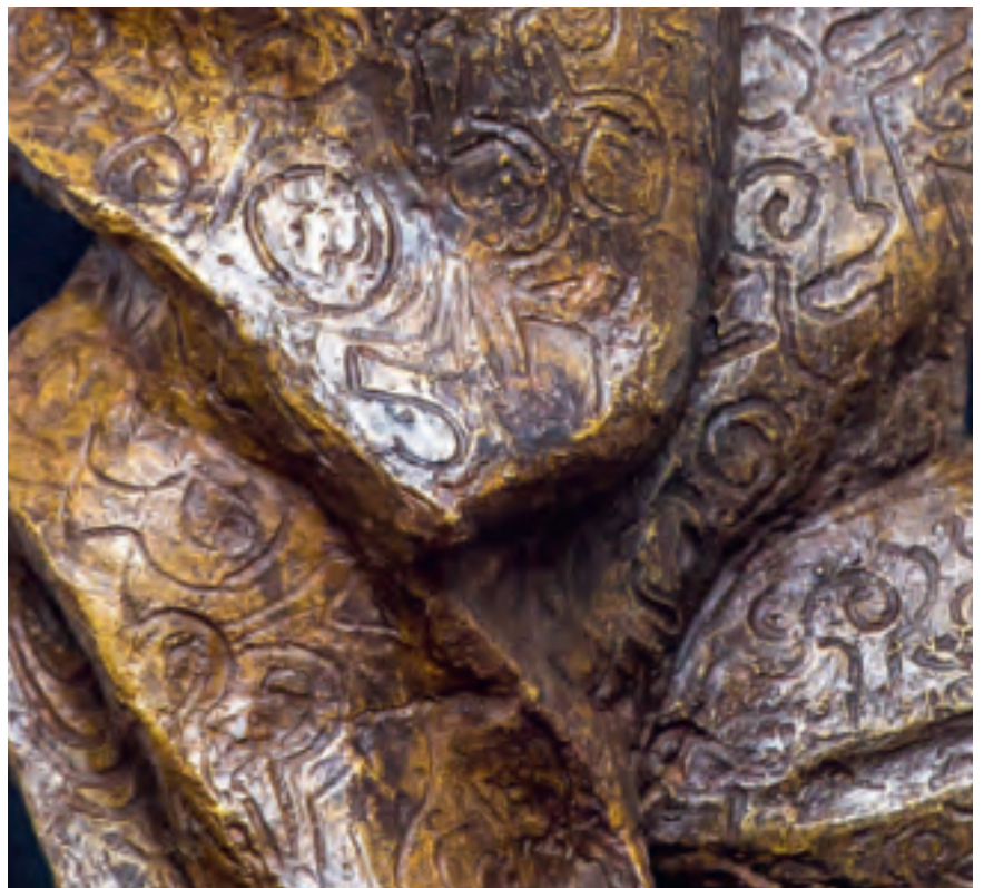
Detail of Isimagodo , 2016