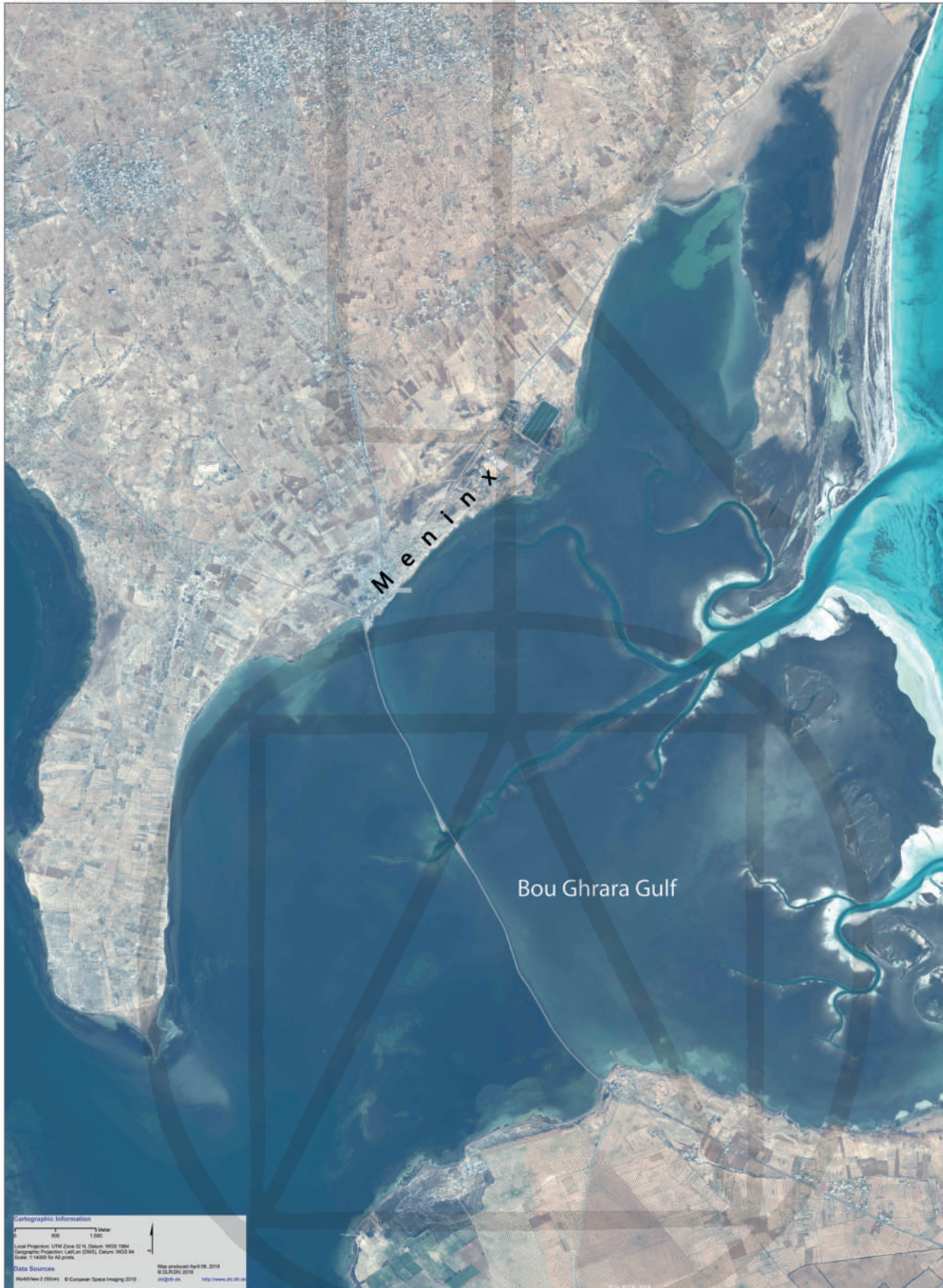
2 Bou Ghrara Gulf, air photograph