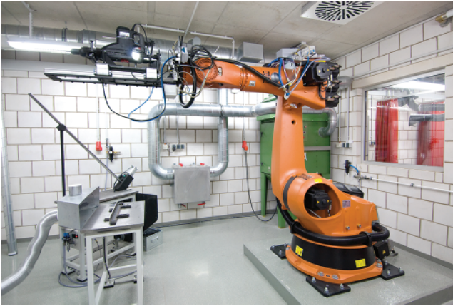
Figure 1.6 Industrial robot fastened with anchors.

are specified in numerous codes of practice, e.g. EN 1992-4 ‘Eurocode 2 – Design of concrete structures – Part 4: Design of fastenings for use in concrete’. The upshot of this is that, more and more often, it is no longer possible to design an anchor with a simple, quick and easily grasped manual calculation. Basically, these days, such anchor technology for professionals is only understood by experienced civil and structural engineers who have the necessary software at their disposal.