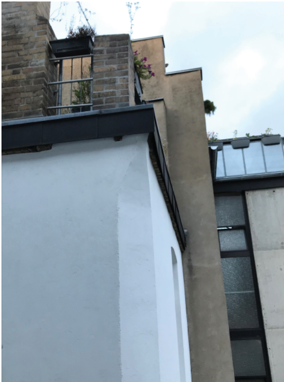
Figure 1.5 Wall from outside (private photo).

This and similar discussions reveal again and again that anchors – products that seem unremarkable in themselves – are probably among those construction products that are used for the most diverse applications but, above all, by the most diverse users. Anchors are used to fasten everything from lightweight bathroom cabinets (Figure 1.1) to heavy industrial robots (Figure 1.6). Fastenings for the latter are subjected to higher dynamic and fatigue-relevant loads – affecting both the anchors themselves and the base material.