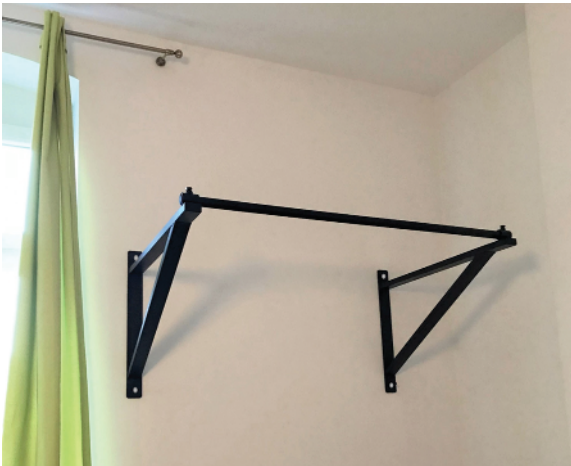
Figure 1.3 Pull-up bar (private photo).