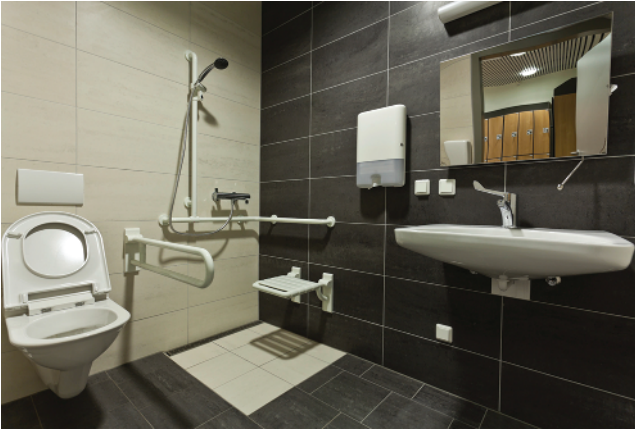
Figure 1.1 Bathroom (photo: Adolf Würth GmbH & Co. KG).