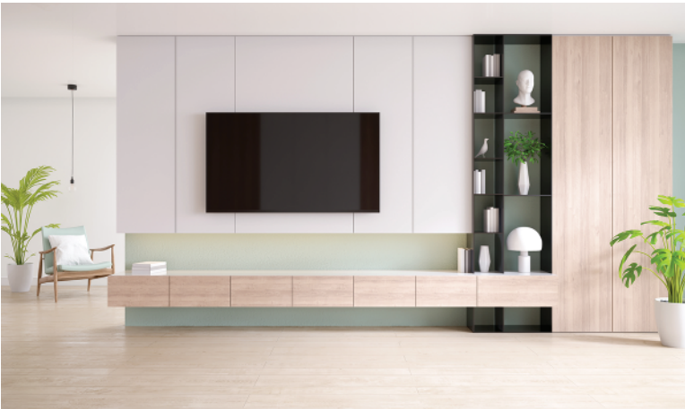
Figure 1.2 Living room.

ANONYMOUS: ‘I used the anchors top and bottom. They came with the bar. (Figure 1.4)’