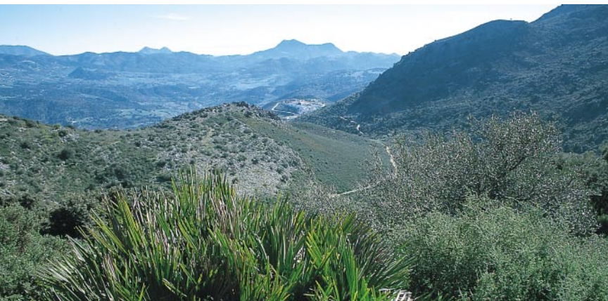
View southwards of the Guadiaro valley from the top of the Sierra del Palo.

From Villaluenga del Rosario to Cortes de la Frontera