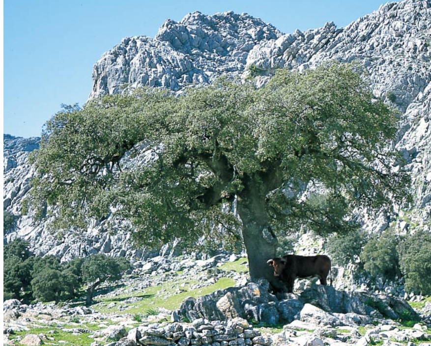
At the edge of the Llanos de Lívar (no fighting bulls, but it's a good idea to keep your distance in any case).

The route to the pass leads past the Cortijo Hoyos de Lívar and eventually a smaller hollow is crossed. Just before you reach the top of the pass go straight ahead at a bend and a little later at a waymarker (wooden post with yellow and white rings) you meet a broad path which you then leave again