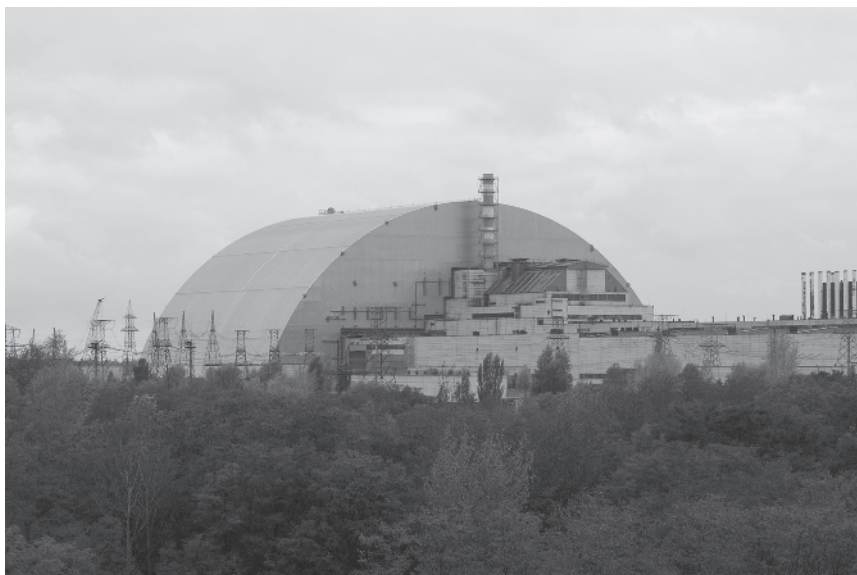
Figure 1.2 After several iterations to safely contain the highly radioactive remnants of the #4 reactor unit at the Chernobyl Nuclear Power Plant, the current New Safe Confinement or NSC was in position as of October 2017. Entombment was necessary because much of the steel structure used in the reactor containment vessel could not be disassembled as it was welded to be permanent and because it is highly radioactive. Besides safe containment of radiation, the €1.5B structure prevents damage by weather and runoff of lingering radioactive contamination.

Figure 1.3a,b shows a couple of examples of extremely well-executed welds made in stainless steel and an Al alloy using the gas tungsten arc process with a filler wire, whereas Figure 1.3c shows a very badly executed repair weld on a steel automobile part, and Figure 1.3d shows a badly factory-made gas–metal arc repair weld on an Al alloy boat.